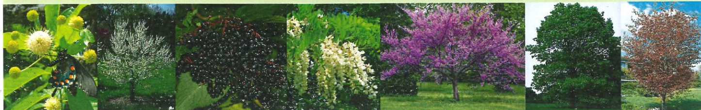
Pictured left to right: Common Buttonbush, American Plum, American Elderberry, Black Locust, Eastern Redbud, White Oak, Washington Hawthorne

Yes, we are giving away 15 varieties of seedlings including: