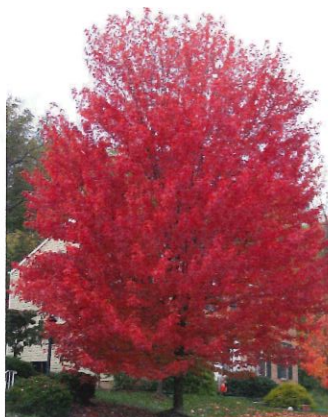
Red Maple tree in autumn